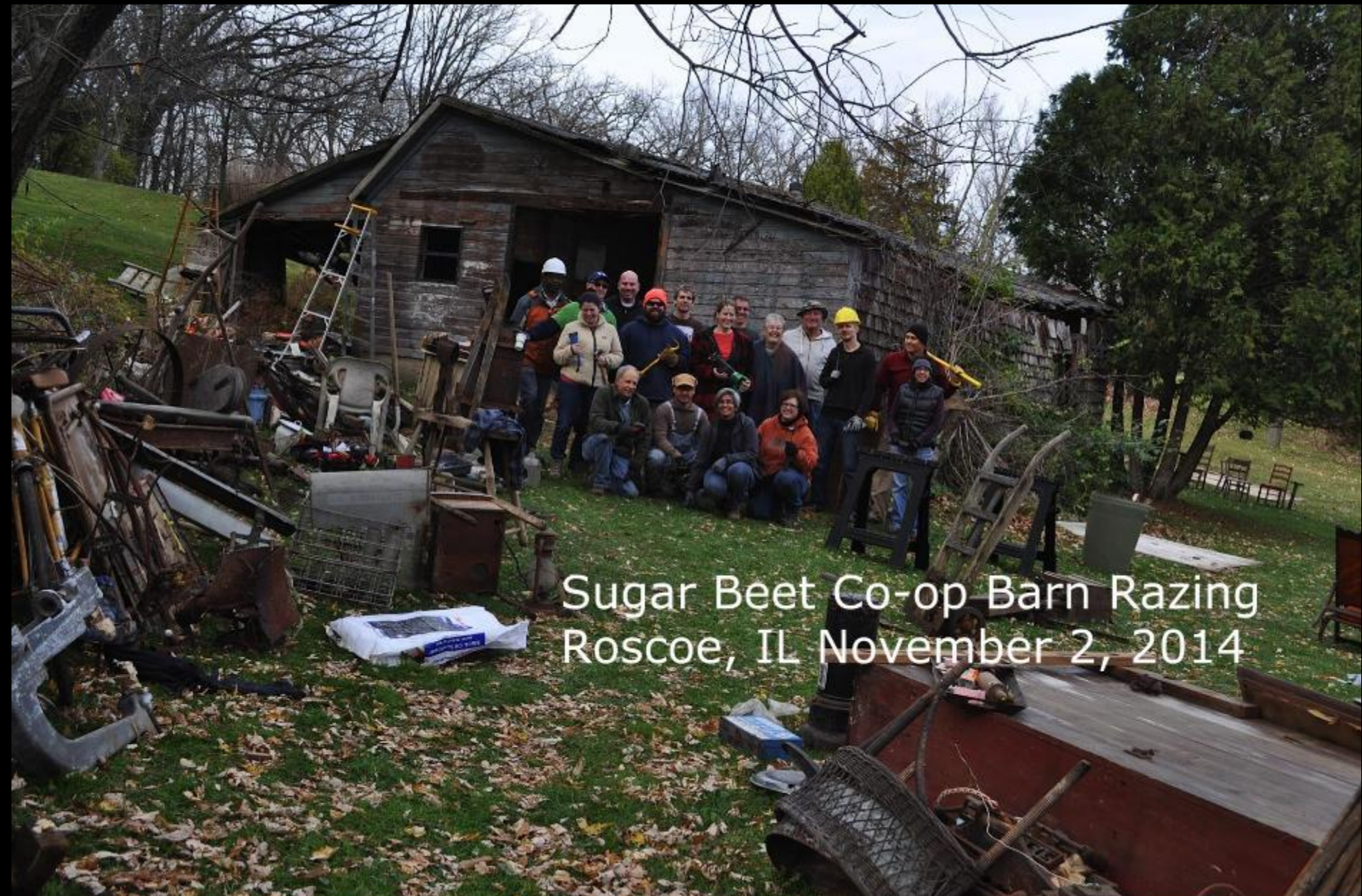
Sugar Beet Co-op Barn Razing Roscoe, IL November 2, 2014